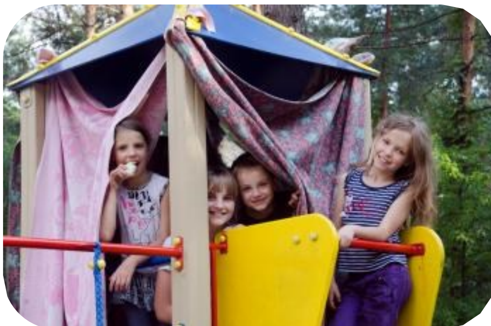
Double traumatised children need time to recover

Most of the children who lived in a conflict affected area witnessed destruction and violence and experienced psychological trauma. They have a number of fears connected with previous experience, e.g. fear to lose parental care and family environment again.